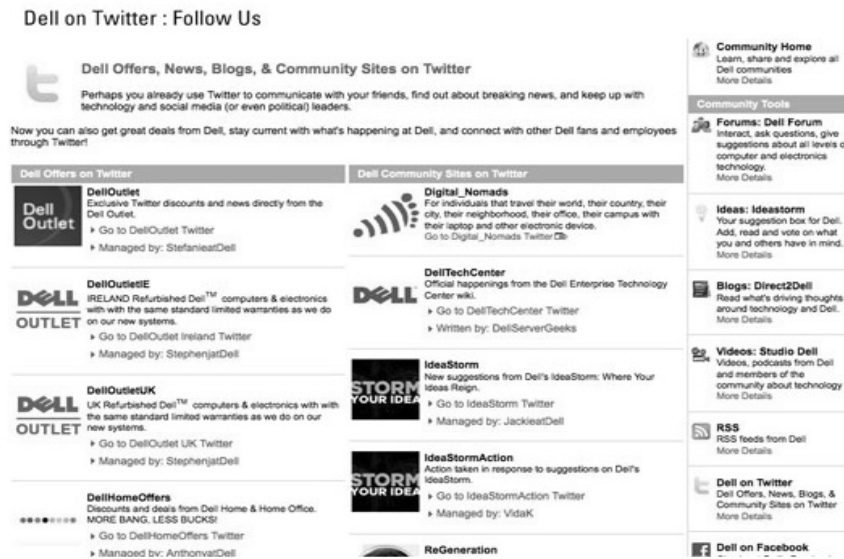
Fig. 2. Methods of contacting Dell company