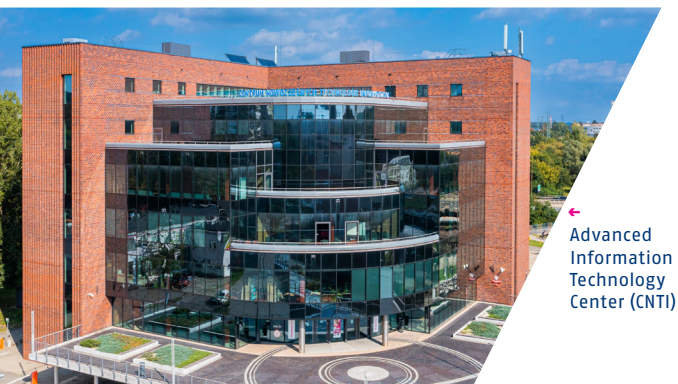
Advanced Information Technology Center (CNTI)