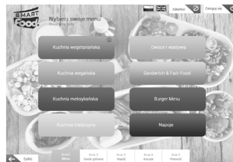
Fig. 2. An interactive prototype of an touch-screen kiosk